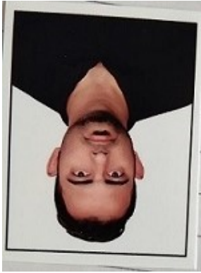
Inverse Photo X