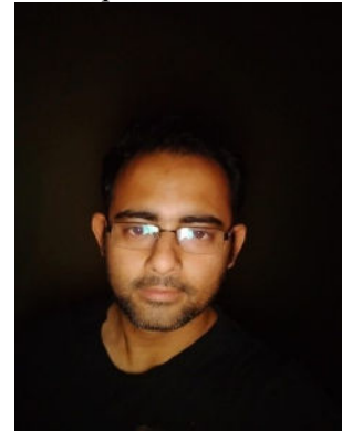
with Spectacles X