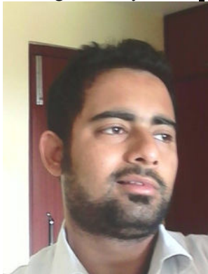
Facing Sideways X