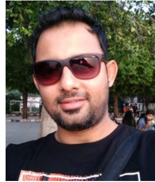
With Googles X